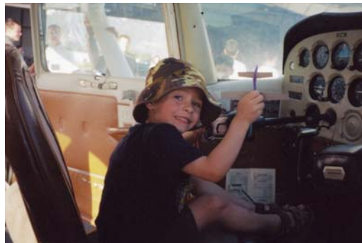
We start them young!

For more information, please visit our website at www.theeagleflight.org , E-mail info@theeagleflight.org , or call (208) 713-2519.